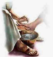
"You should wash each other's feet" (John 13:14).